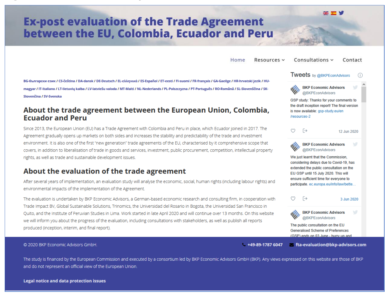
Figure 1: Screenshot of study website

The use of meta data (keywords and strings of words) will ensure that the website is found easily on search engines in order to increase visitor counts and further impact. The website address will also be promoted among a large range of stakeholders and partners.